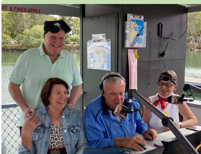
Winners – Houseboat hire