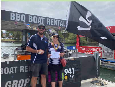
Winner – best dressed pirate