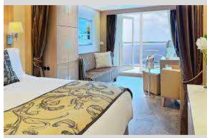
Your luxurious accommodation in a Verandah Suite with balcony