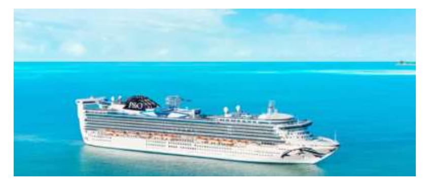
Departing 12th April 2025 Brisbane – Sea Day – Willis Island – Cairns (2 Days) – Airlie Beach – Sea Day – Brisbane

RENEW YOUR MEMBERSHIP TO GO INTO THE DRAW FOR A CHANCE TO WIN 7 DAY P&O PACIFIC ENCOUNTER CRUISE FOR 2 IN A BALCONY MINI-SUITE