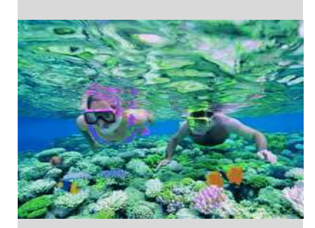
Cairns is renowned around the world for its famed natural wonders such as the World Heritage Listed Wet Tropics of Queensland, which includes the Daintree Rainforest, and the iconic Great Barrier Reef.

Spacious living quarters with all the comforts of home. Mini Suites are light and airy, with floor to ceiling windows, a full balcony and a comfortable, stylish living area.