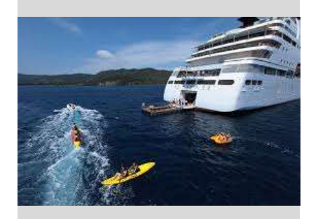
Wonderful off board activities (Some external activities not included) Full travel Terms and Conditions available from Travel Masters.